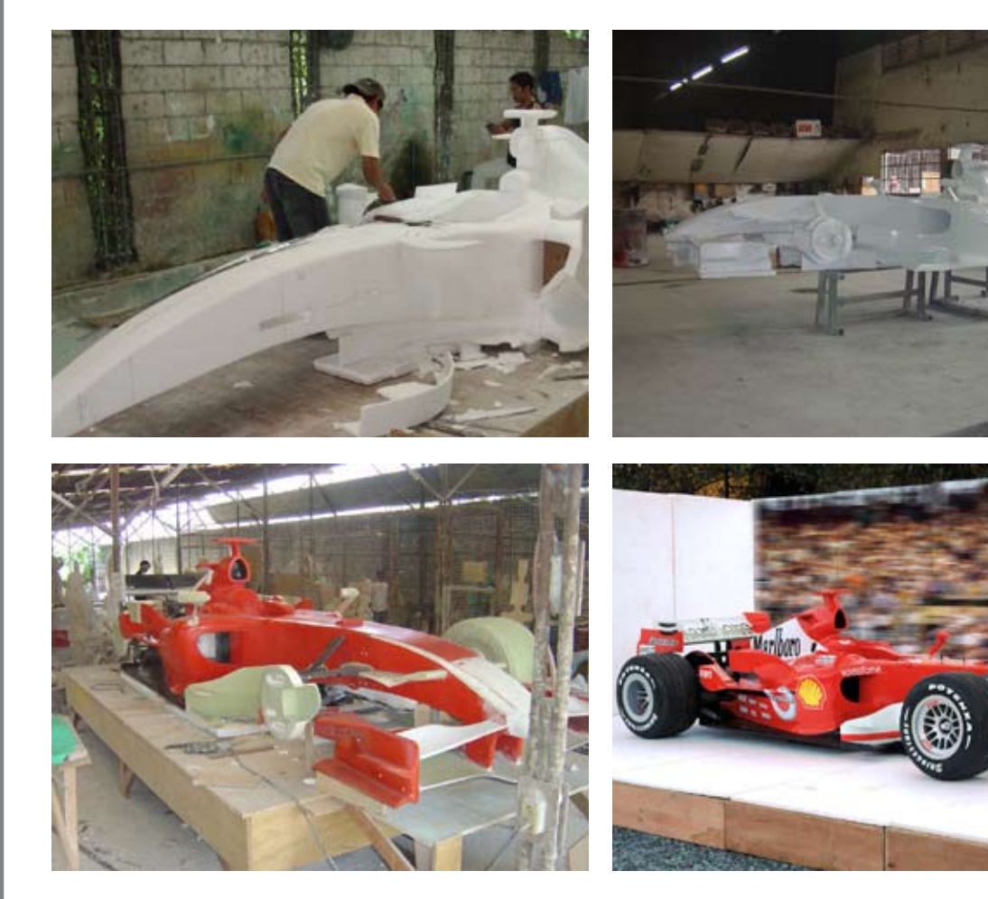
As illustrated with an FI racing car, the intital sculpture is made from styrofoam, with the finished product made out of polyresin model and custom painted to the clients specifications. All moulds are kept for reproduction or multiple models